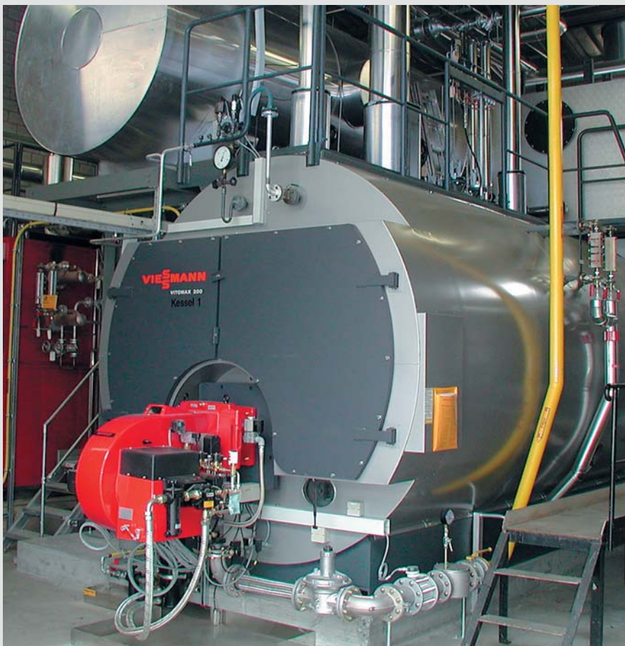
Figure 2: Steam boiler with a steam generating capacity of 4 t/h, 13 bar, with integral waste heat flue for a CHP station delivering 0.4 t/h (waste heat pipe not yet connected)